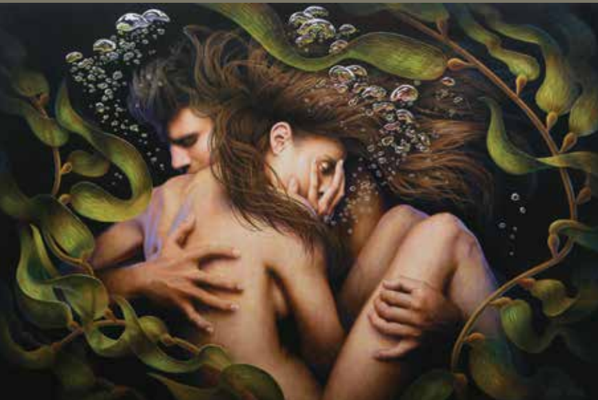
(ABOVE) JESSE LANE (b. 1990), Undercurrents, 2020, colored pencil on board, 26 x 39 in., RJD Gallery (Romeo, Michigan)

(LEFT) KIMBERLY DOW (b. 1968), Soft on Soft, 2009, oil on panel, 30 x 20 in., available through the artist