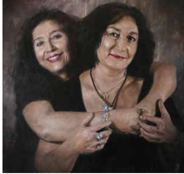
(LEFT) MATTHEW BIRD (b. 1977), Hidden Kiss, 2017, watercolor on paper on ACM panel, 30 x 14 in., available through the artist (TOP) AIDA GARRITY (b. 1957), At the Museum, 2017, oil on linen, 24 x 18 in., available through the artist (ABOVE) JAQ GRANTFORD (b. 1967), Sisters, 2019, oil on canvas, 36 1/4 x 36 1/4 in., private collection