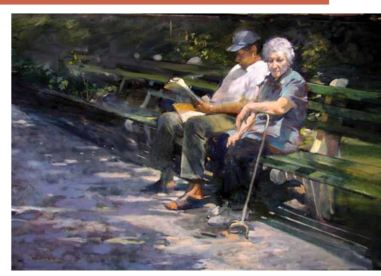
BURTON SILVERMAN (b. 1928), Park Bench , 2004, oil on linen, 32 x 50 in., private collection

Artists have long been intrigued by couples not only for their narrative potential (think Romeo and Juliet), but also because the body language of people who are just that comfortable with each other differs noticeably from other pairs'. As inveterate observers, artists get interested when they discern that distinction, and so we are glad to illustrate here an array of recent images revealing the almost infinite possibilities this timeless motif can evoke.